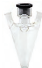
40-250 ml Vessel 830-00013