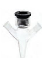
10-50 ml Vessel 830-00012