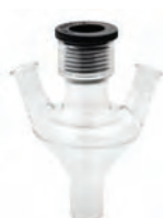
3-10 ml Vessel 830-00011