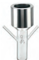
Suslick Vessel 830-00007

*** Must be used with the adapter Part No. 830-00014 and special probes listed above.