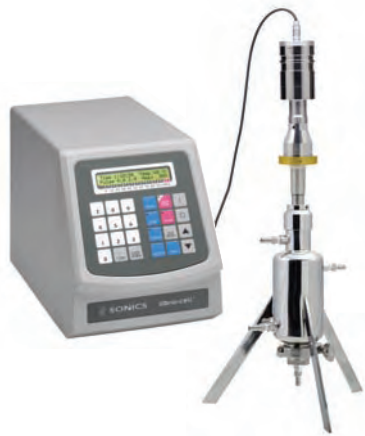
VC 750 HV