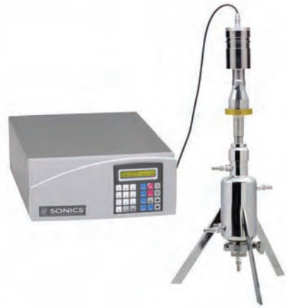
VCX 1500 HV

When used in conjunction with the VC 750 ultrasonic processor and booster Part No. BHNVC21, the flow cell throughput rate is typically 50 liters/hour. When used in conjunction with the VCX 1500 ultrasonic processor and booster Part No. BHNVC31, the flow cell throughput rate is typically 100 liters/hour – variables being viscosity and desired degree of processing. The flow cell is recommended for the treatment of low viscosity samples which do not require extended exposure to ultrasonics. Designed primarily for dispersing and homogenizing. For optimum performance, when working on a flow through basis, premixing the sample with a mechanical mixer or stirrer is recommended. The flow cell is easily disassembled for inspection and cleaning, and is water jacketed to enable cooling/heating the sample while it is being processed. All wetted parts are autoclavable.